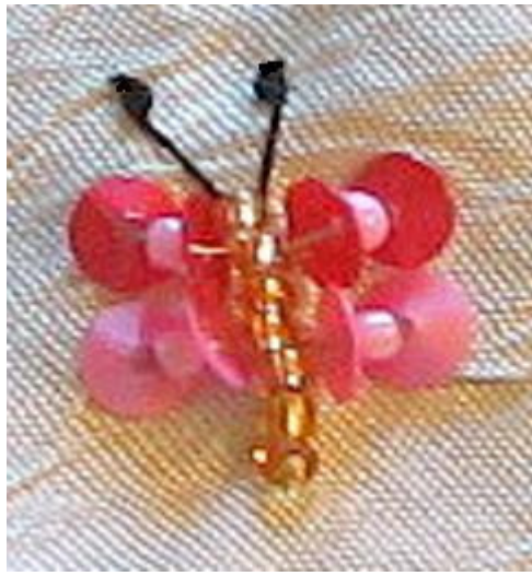
9 mm sequins and beads for the antennae