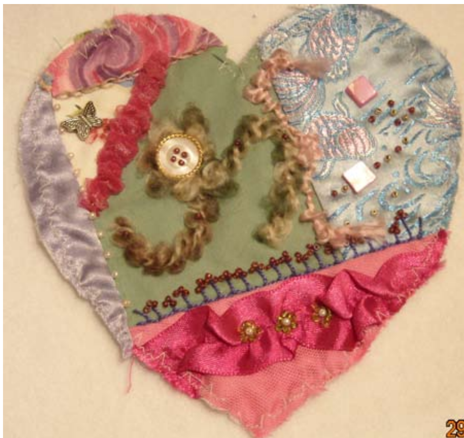
CQ Heart with beads, buttons, and butterfly charm